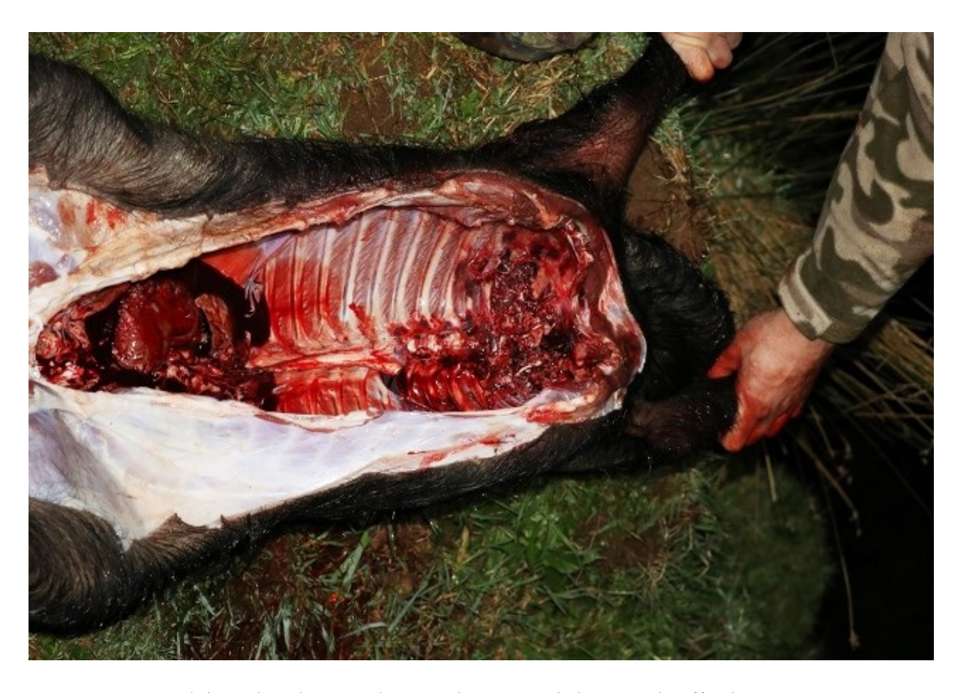
Kelvin's pig. The 30 Cal 225 grain ELD-M is immensely effective.