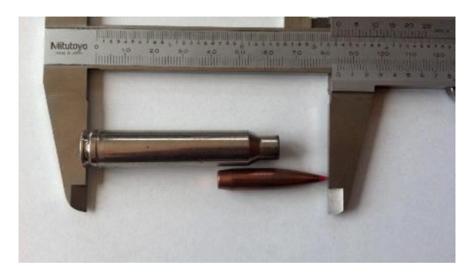
A .300 Win Mag case with an ELD-M, displayed as it would sit if seated to suit a Tikka T3 rifle magazine. As described in the book series, this is a deal breaker. I would urge all of my readers to be mindful of these factors.

In other instances, the long bullets are simply a no-go, the magazine lengths are simply far too short for the longest / heaviest of bullets within a given caliber. Again, this mostly applies to the magnums. I have gone to great efforts to cover these factors in the book series but do consider the fact that as bullets continue to get longer, you may need an extra 40 to 80 thou (1-2mm) magazine space for smooth magazine feeding.