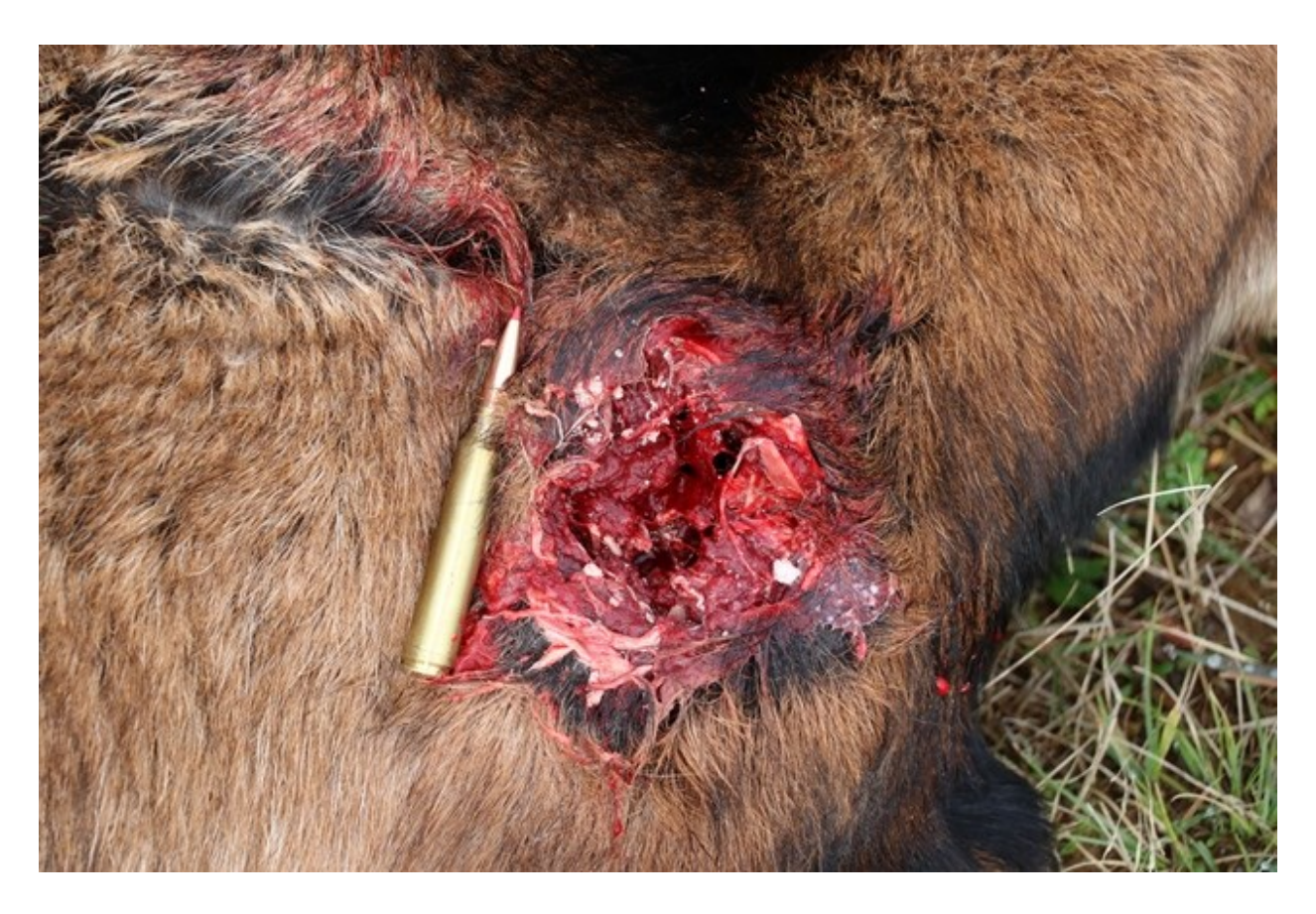
The 7mm 180gr ELD-M is a hard hitting bullet. I shot this feral goat out at 300 yards, taking out both shoulders.