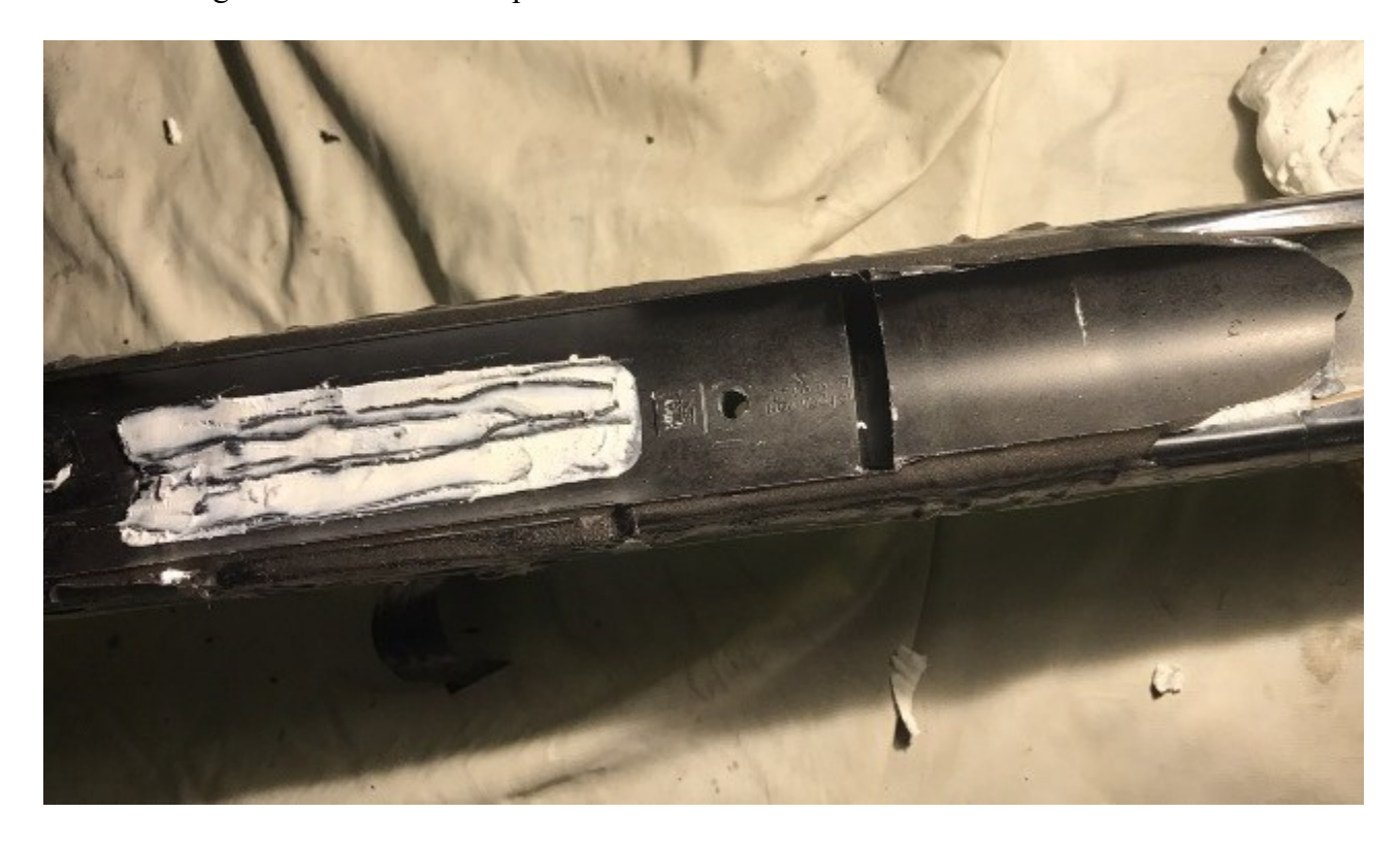
A client takes a first look at his bedding job after the break out. It is a great result and after the clean up, this will serve as an outstanding platform for accuracy.

After this comes the reloading book, again designed to make life simple, then finally we bring it all together in the shooting book. This last book is designed help you achieve success under real world hunting conditions when the pressure is on.