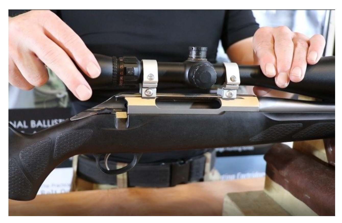
Positioning optics (Sightron) prior to test shooting the Tikka T3.

and 85. Each video has a written explanation of its content to help the viewer decide which video applies to them. These videos work in conjunction with the book series and in time we will have more videos on various subjects including dedicated long range shooting technique. Our videos are hosted with Vimeo, rental only (3 months). If you wish to view these videos, please click here to view our video shopping pages. The links on our shopping pages will redirect you to the Vimeo rental pages.