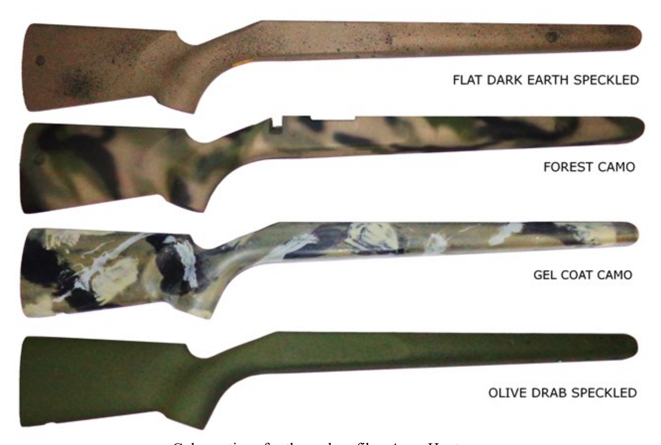
Color options for the carbon fiber Apex Hunter.

To view my video footage of the Precision platforms rifle stock in action, please visit <a href="https://youtu.be/D50hQluX9hY">https://youtu.be/D50hQluX9hY</a>.